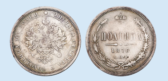
2174 Poltina 1876 CΠБ. No moneyer's initials. Bit 122 (R1), Ilyin (8 Rubl.), S 3855 (R). Rare. Tiny reverse dig.