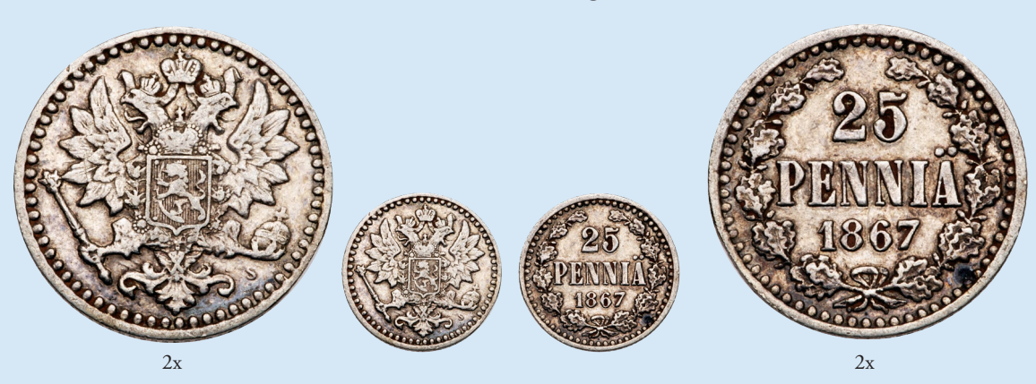
2193 25 Penniä 1867 S. Bit 643 (R2), Uzd 4683. Very rare, Key date. Medium gray. Extremely fine