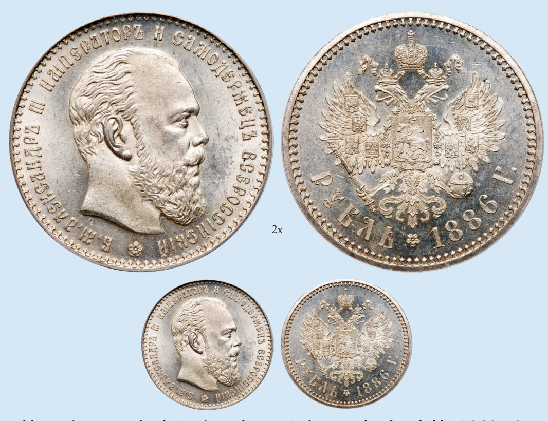
2200 Rouble 1886 AΓ. <u>Large head.</u> Bit 60, Uzd 2002. Authenticated and graded by PCGS MS 63 (Pre-2008 holder, # 925861). Finely detailed types toned light satiny gray with cascading lustre. Choice brilliant uncirculated.