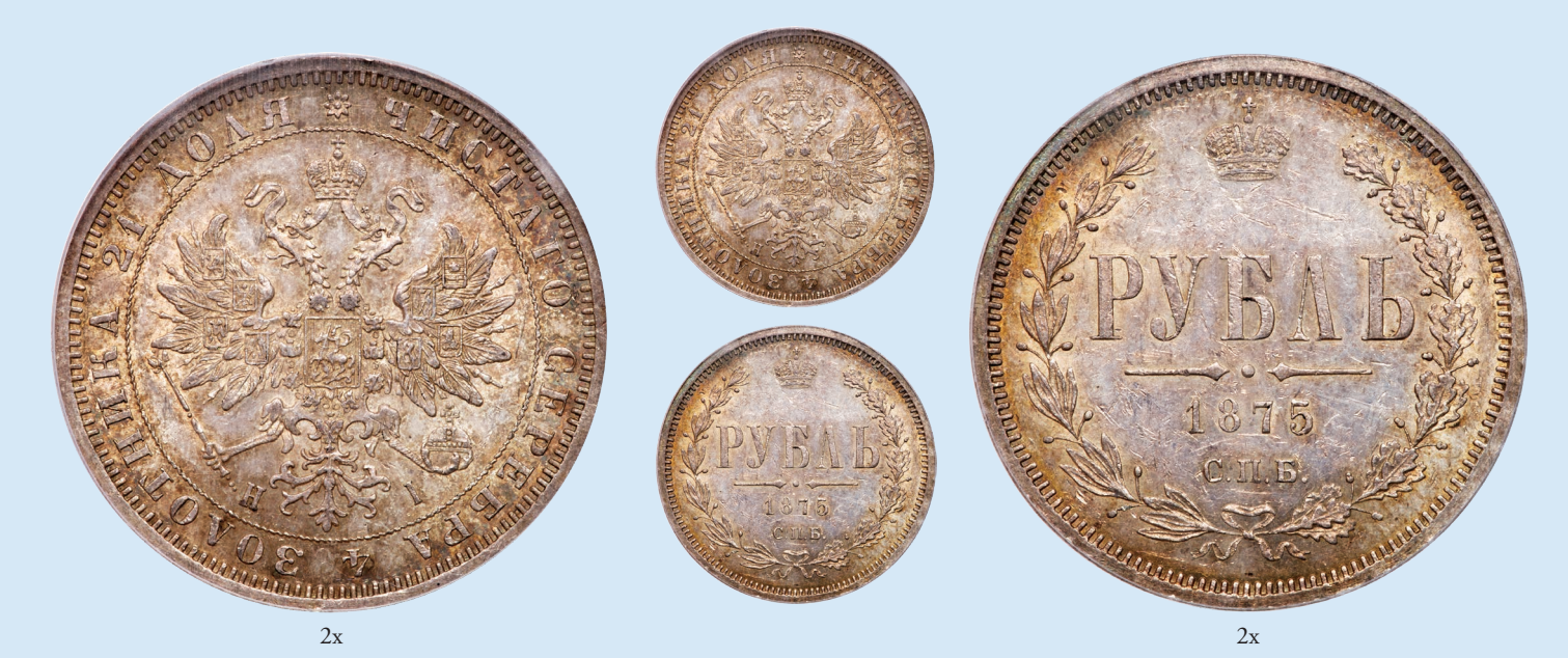
2169 Rouble 1875 СПБ-НІ. Bit 88, Sev 3849 (S). Mintage: 687,003 pcs. Authenticated and graded by PCGS MS 62 (Pre-2008 holder, # 925819). Satiny lavender gray with russet hues. Brilliant uncirculated.