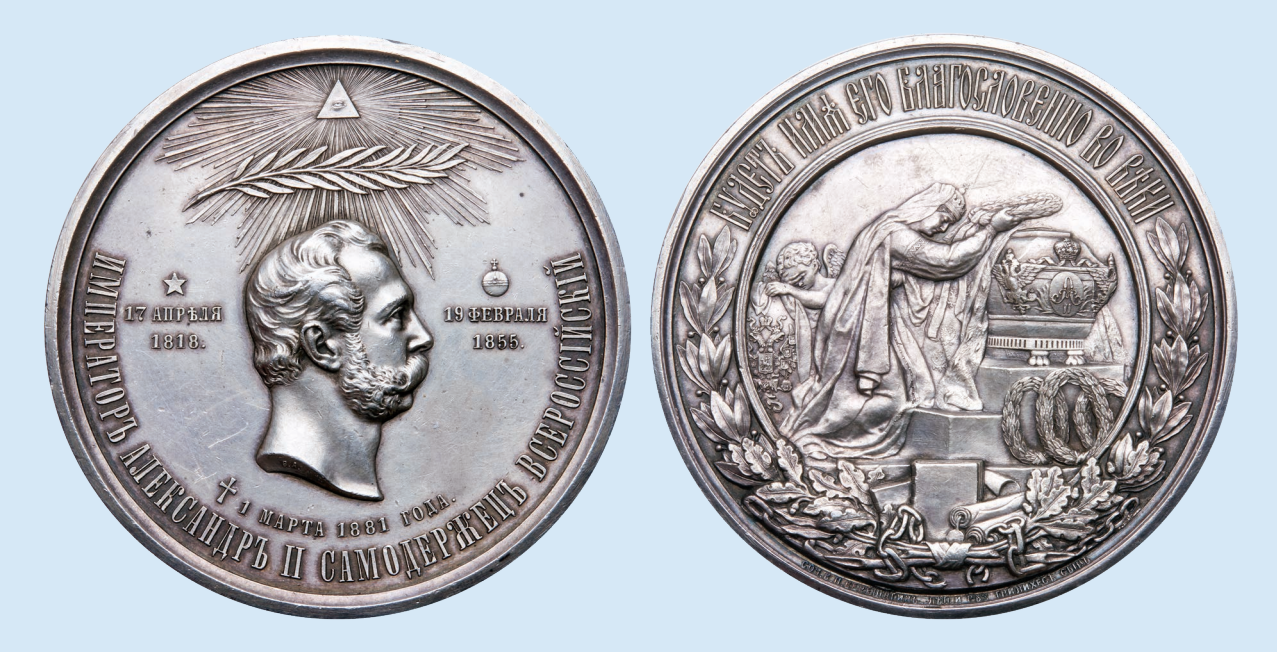
2192 On the Death of Alexander II, 1881. Medal. Silver. 76.5 mm. By V. Alexeev and A. Griliches. Diakov 881.1 (R2), Sm 830. Alexander II head right, initials B.A, on truncation, Radiant All-Seeing Eye and palm frond above / A mourning Russia kneels and places wreath on coffin, angle grieves on shield with Russian Arms. In original green-plush Imperial presentation case for the funeral ceremony, silver Alexander III cipher on lid. Toned. Extremely Fine.