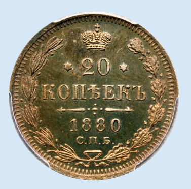
20 Kopecks 1880 CΠБ-ΗΦ. Bit 233, Sev 3900. Authenticated and graded by PCGS MS 66 2175 PL (# 38930271). Gold and iridescent hues.

Superb gem uncirculated, Prooflike strike.