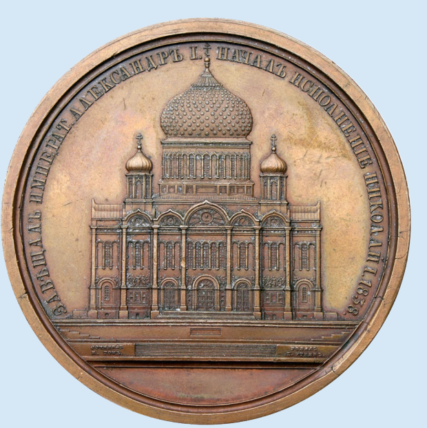
2162 Groundbreaking on the Temple of Christ the Savior in Moscow, 1838. Medal. Bronze. 78 mm. By P. Utkin. Diakov 540.1 (R1), Sm 496. Radiamnt All-Seeing Eye, date "1812 ГОДЪ" below / View of the Temple. Extremely fine.