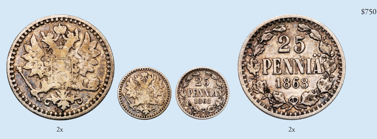
25 Penniä 1868 S. Bit 644 (R1), Uzd 4688. Rare , semi-key, mintage: 136,000. Toned. About very fine / Very fine.