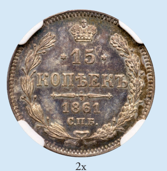
2176 15 Kopecks 1861 СПБ no initials. Struck in France. Bit 290, Julian 334, Sev 3716 (R). Authenticated and graded by NGC MS 63. Pale lavender-gray, bold lustre. Choice brilliant uncirculated, and an exceptional grade for the issue.