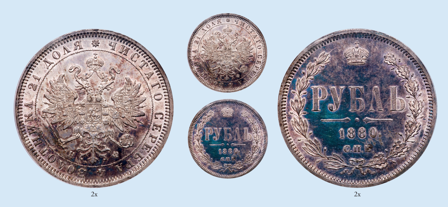
Rouble 1880 CΠБ-HΦ. Bit 94, Sev 3903 (S). Mintage: 521,008 pcs. Authenticated and 2171 graded by PCGS MS 62 (Pre-2008 holder, # 925825). Crisp devices in pale vermilion-gray Choice brilliant uncirculated. toned fields with ample lustre.

Ex "The New York Sale XVIII", Jan. 10, 2008, lot 1330