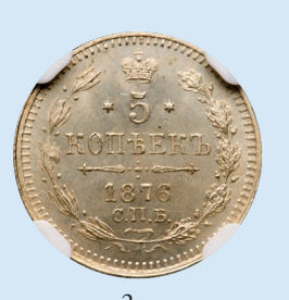
2177 5 Kopecks 1876 CΠБ-HI. Authenticated and graded by NGC MS 65 (# 346017). Meticulous devices in boldly lustrous fields. Very choice brilliant uncirculated.